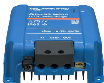
Orion XS 1400 DC-DC battery charger connection area