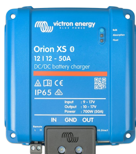
Orion XS 12/12-50A DC-DC battery charger