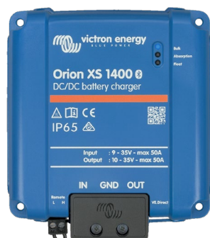
Orion XS 1400 DC-DC battery charger